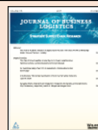
Journal of Business Logistics