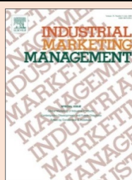
Industrial Marketing Management