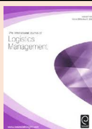
International Journal of Logistics Management