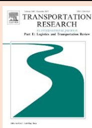
Transportation Research Part E