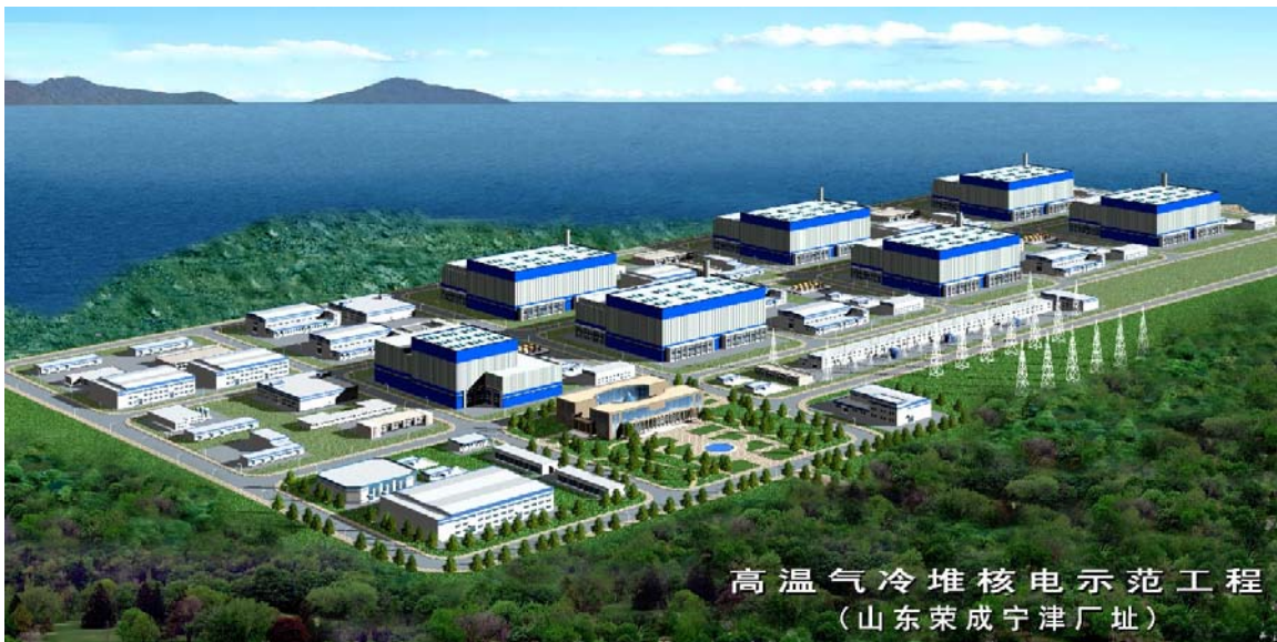
Figure 4: Rongcheng Pebble Bed Plant - 3600 MWe - 19 PBR Modules- Helium Steam Plants

are expected to come to use in the next 10 to 20 years. China's view is that these reactors can provide supplemental electric power for densely and sparsely populated regions and for processing heavy oil and coal to reduce air pollution. 17 The Juelich Research Institute is where the first pebble bed research reactor was operated for over 22 years. Tsinghua University's Institute of Nuclear Energy Technology (INET), with the assistance of German engineers, designed and built a 10 megawatt thermal (Mwth) high temperature helium-cooled pebble bed reactor capable of producing four megawatts of electricity using a steam turbine generator. The reactor began operations in December of 2000 and has demonstrated its inherent safety characteristics by completing significant safety tests. At present, it is the only operating pebble bed reactor in the world. China has advanced this technology to the point where a full scale 190 megawatt electrical (Mwe) demonstration plant has been approved by the Chinese government to be built at Weihai in Shandong province, with construction beginning in 2007 and operations starting in 2011. 18 An artist rendering of the proposed site is shown on Figure 4.