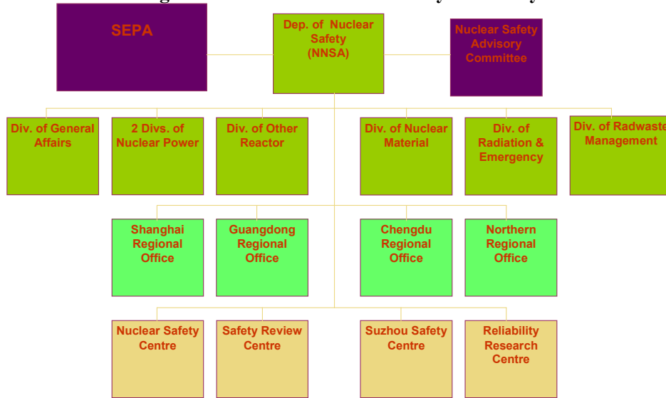
Figure 2 : National Nuclear Safety Authority

China has developed top-level nuclear safety regulations on site location, safety in design, operations, and quality assurance. They annually set up inspection plans for each power station which focus on key areas of the regulations to assure compliance. They also have special inspections and reviews based on events that may occur at the plant. While the organizational framework is quite similar to the U.S. system, the intrusiveness of the regulator in day-to-day operations is not. The onsite inspectors follow the overall plans for inspections but are not as involved in day-to-day oversight of normal operations and outages. The local inspectors oversee the compliance reporting and review the notices of operating events that may not be in compliance with regulations. In U.S. plants, Nuclear Regulatory Commission inspectors spend a considerable amount of time independently reviewing plant operations, actively observing plant staff meetings, and having discussions with plant management and staff about current operations and activities. This is not the common practice in China since the regulator, while on site, is not as actively involved. Chinese regulatory personnel do perform inspections and oversee major activities during outages, however.