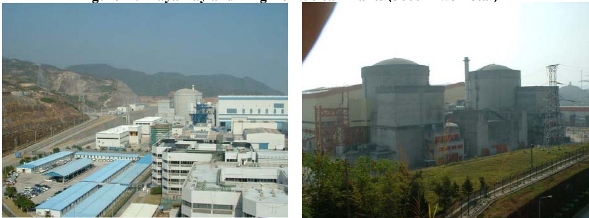
Figure 1 : Daya Bay and Ling Ao Nuclear Plants (3600 Mwe Total)

China, at present, has nine operating nuclear power stations. Three of these reactors were indigenously designed (Qinshan 1, 2 and 3); four were purchased from Framatome with Electricité de France managing construction (two each at Daya Bay and Ling Ao which are on the same site but have different plant names); and two were purchased from Atomic Energy of Canada under a turnkey contract (Qinshan 4 and 5). The indigenous reactors were designed and built by Chinese engineers, with Chinese manufactured components, replicating Western reactor designs. All of the units with the exception of Qinshan 4 and 5 are standard pressurized water reactors, which is the chosen technology for China. Qinshan 4 and 5 are Canadian CANDU-6's, which are pressurized heavy water reactors fueled with natural uranium compared to the low enriched uranium pressurized water reactors (PWRs). 9 Shown on Figure 1 are the Daya Bay and Ling Ao plants currently in operation. Four nuclear power stations are currently under construction in China. Two Tianwan Russian-designed pressurized water reactors (VVER 1060 megawatt electrical) are being built in Jiangsu with startup scheduled for 2006. In late 2005, the initial concrete was poured for two plants called Ling Dong units at the Daya Bay site. When the Ling Dong units are complete, the Daya Bay location will have six operating French pressurized water reactors. The Daya Bay, Qinshan and Tianwan units are all managed and operated by state-owned corporations.