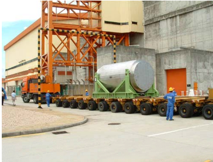
Figure 6: NAC International shipment of Spent Fuel From Daya Bay

China, like all nations that use nuclear power, has chosen deep geological disposal for the residual high-level waste coming from the reprocessing plants. The general area selected is in northwest China at Beishan, near the Gobi Desert. This area is sparsely populated and very dry. Several bore holes have been drilled in the area into granite formations. These exploratory studies will determine the suitability of the site for long-term disposal. China plans to build an Underground Research Laboratory by 2015 with an operational repository to be opened by 2040. 26 While China currently has fewer than 1000 metric tons of spent fuel in storage, it expects to reach 1000 metric tons by 2010. Once all the plants that are currently being ordered become operational, the country will be producing 1000 metric tons per year. It is for this reason that China believes that reprocessing and recycling is the proper path forward in terms of waste management and waste volume reduction.