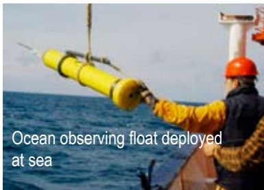
Ocean observing float deployed at sea

JIMO is currently seeking applications for its 2009 Summer Internship Program. Applicants should be inquisitive and motivated undergraduate students with a strong background in quantitative science with majors in Marine Science, Chemistry, Biology, or Engineering. Applicants must be U.S. residents or permanent citizens.