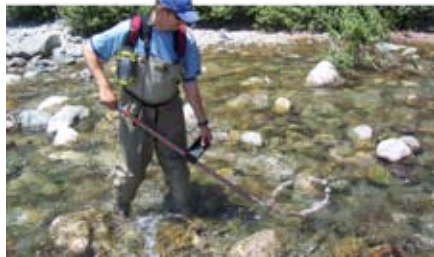
Juvenile steelhead implanted with transponder tags tracked using a portable antenna

The Joint Institute for Marine Observations (JIMO) is a cooperative institute between Scripps Institution of Oceanography/UC San Diego and the National Oceanic and Atmospheric Administration (NOAA). Its mission is to foster and enrich a center of excellence in which scientific research, education and public outreach are joined to strengthen and improve our understanding of global ocean, climate and earth sciences through individual and collaborative research.